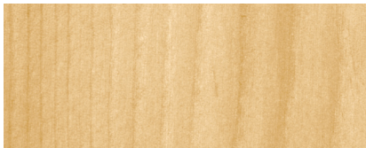
070 W INCOLORE